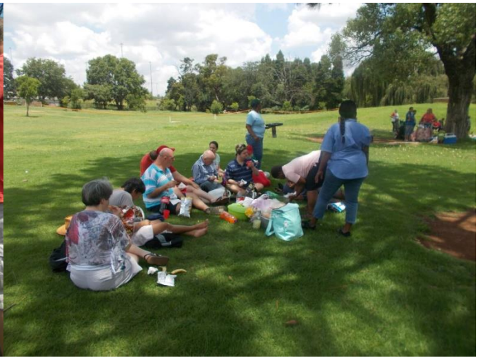
PICNICS AT GILLOOLY'S FARM AND ZOO LAKE