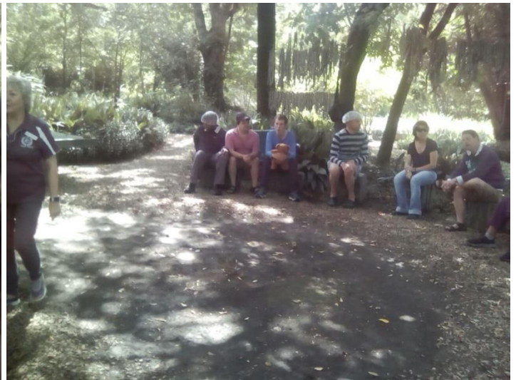
HOSTING UNITY COLLEGE IN THE WETLAND PARK